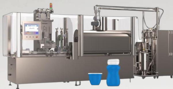
COMBISTEAM FB80 -AGV100